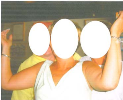
Who Are We ?

Go to www.burlingtonshagclub.com and email us with your answer. In the subject line, type in "Mystery People"